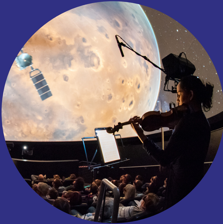
The Planets 2018 - various composers, performed by Ligeti Quartet, Bristol Planetarium.