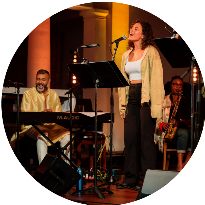
Arun Ghosh's The Canticle of the Sun , Spitalfields Music Festival, 2022.