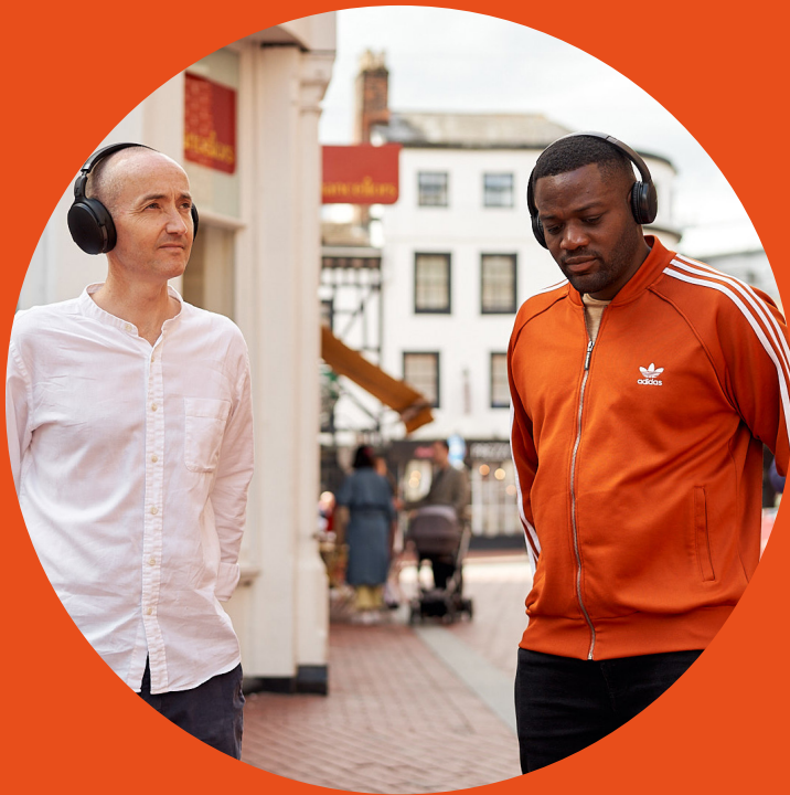
Reading Audio Trails, A Huntley and Palmers Journey, June 2022.

"Always a pleasure to have any involvement with Sound UK, their imagination, inspiration, their long-term experience and outstanding professionalism. Thank you." – Artist