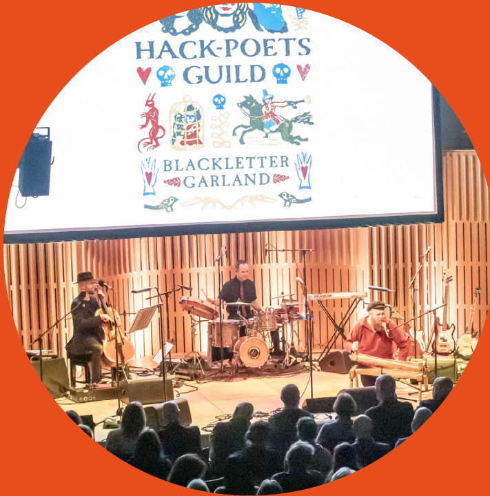
Hack-Poets Guild, Howard Assembly Room Leeds, March 2023.

The 7-date tour reached audiences around the country with sell out performances in a number of locations, including Oxford and Bristol. Originally commissioned by Sound UK and OCM, the project also featured a debut album Blackletter Garland , which was released on One Little Independent to coincide with the live tour, and has been met with huge critical acclaim. The tour continues in summer and autumn 2023.