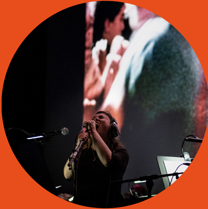
Arcadia Live , International Documentary Film Festival Amsterdam, March 2023.