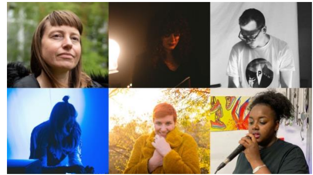
Sound Generator 2021 Artists