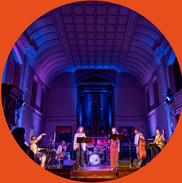
Arun Ghosh's The Canticle of the Sun , Spitalfields Music Festival, 2022.