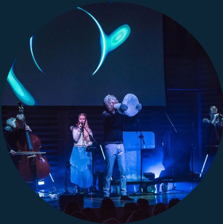
Terje Isungset's Arctic Ice Music at Kings Place, London, 2021.