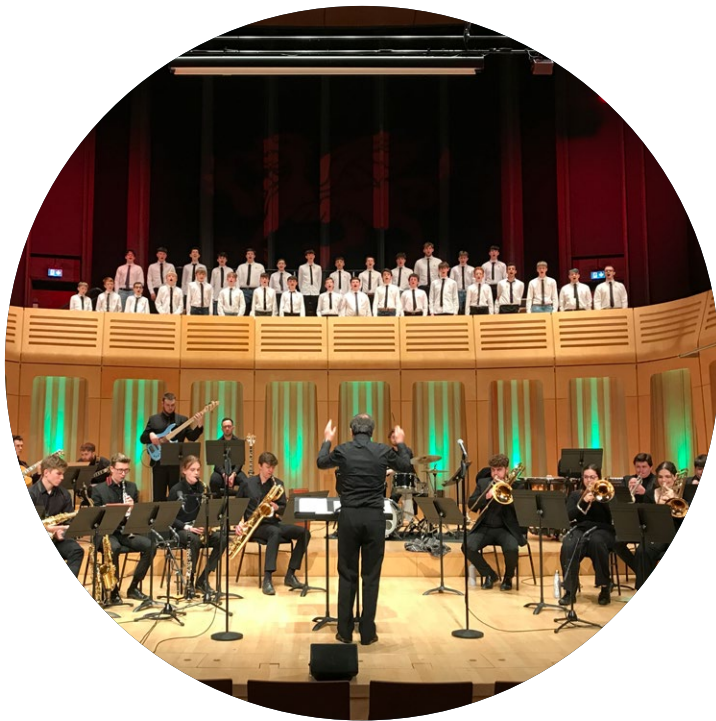
Just Breathe, A Song for Wales. RWCMD Big Band and singers from choirs of The Aloud Charity, at Royal Welsh College of Music and Drama, 2022.