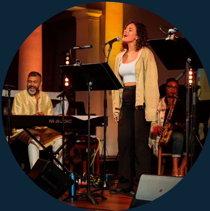
Arun Ghosh's The Canticle of the Sun , Spitalfields Music Festival, 2022.