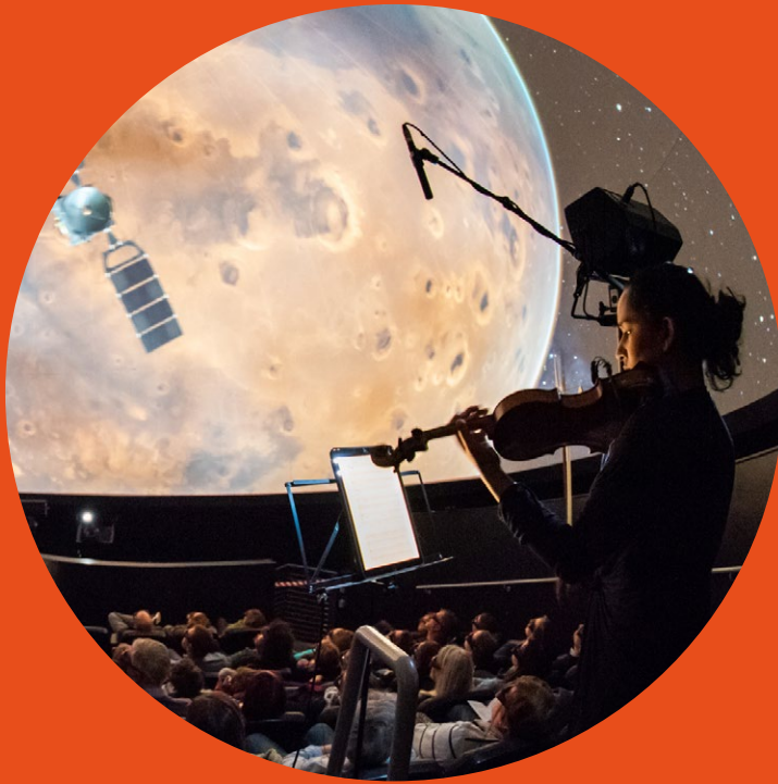
The Planets 2018 – various composers, performed by Ligeti Quartet, Bristol Planetarium.