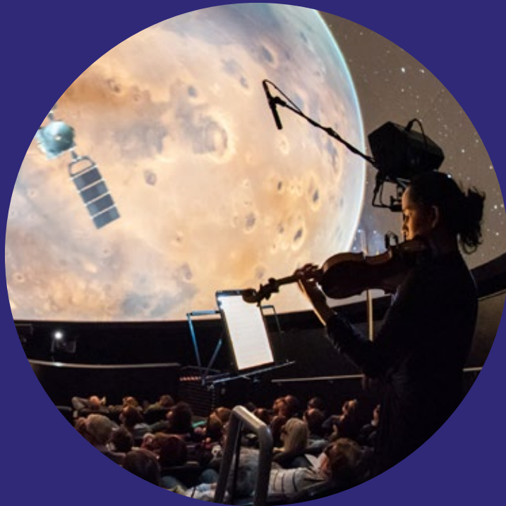
The Planets 2018 - various composers, performed by Ligeti Quartet, Bristol Planetarium.