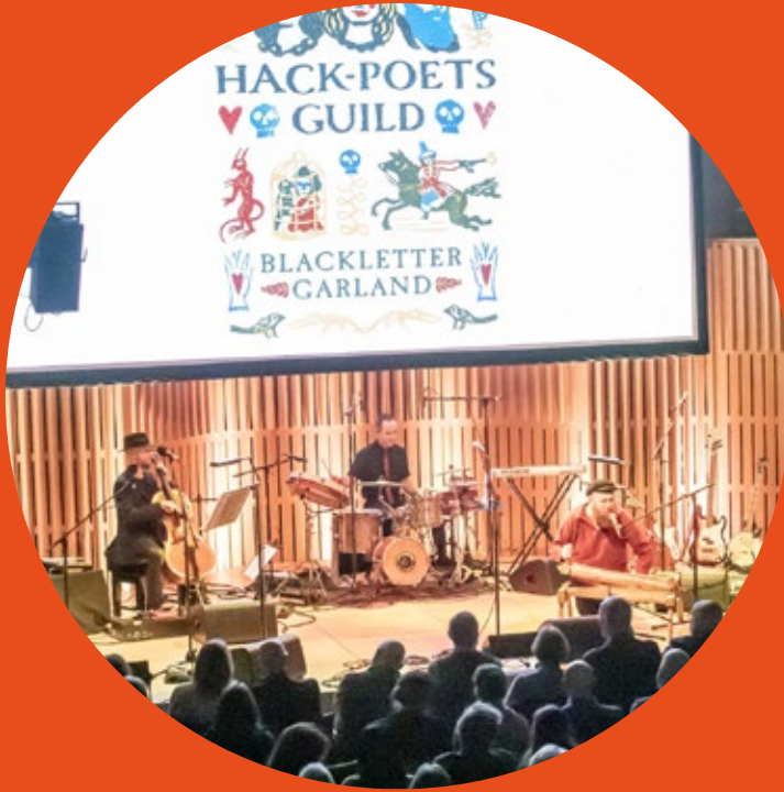
Hack-Poets Guild, Howard Assembly Room Leeds, March 2023.