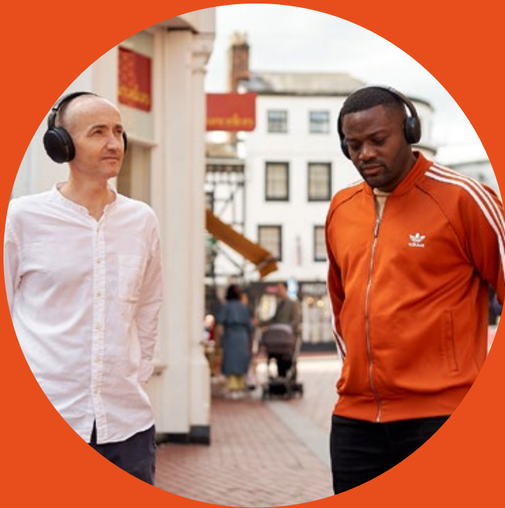
Reading Audio Trails, A Huntley and Palmers Journey, June 2022.

"Always a pleasure to have any involvement with Sound UK, their imagination, inspiration, their long-term experience and outstanding professionalism. Thank you." – Artist